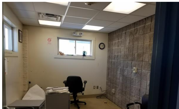
Physician and Staff Office