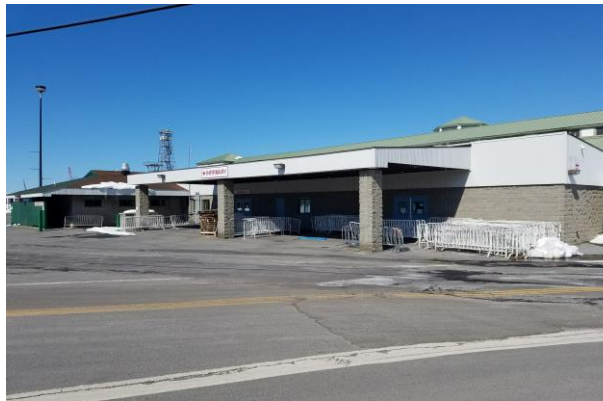
Entrance to the Infirmary

Note: All medical equipment in the pictures is not owned by AGM and will have to be provided by the selected contractor.