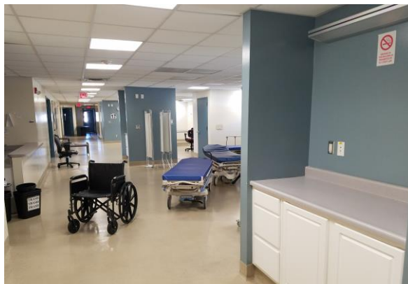
View of Hallway, Exam Rooms