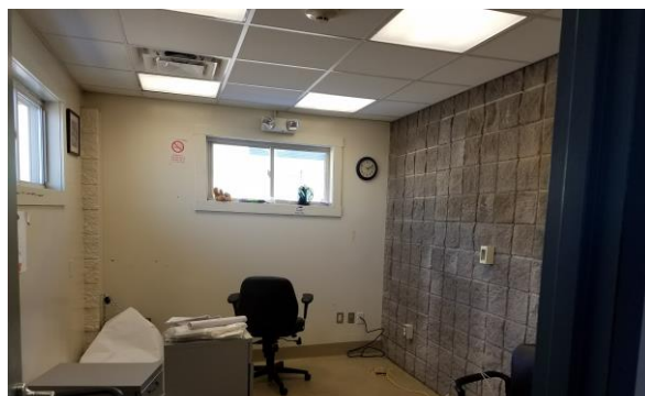
Physician and Staff Office