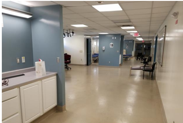
View of Hallway, Exam Rooms

Note: All medical equipment in the pictures is not owned by AGM and will have to be provided by the selected contractor.