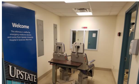
Patient Reception Area